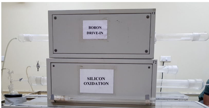
Semiconductor Fabrication Lab